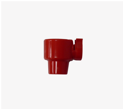
Insulating tap body cover 94514

For EconoBoil and HydroBoil. A heat cover for exposed tap outlets preventing the user from any accidental burns.