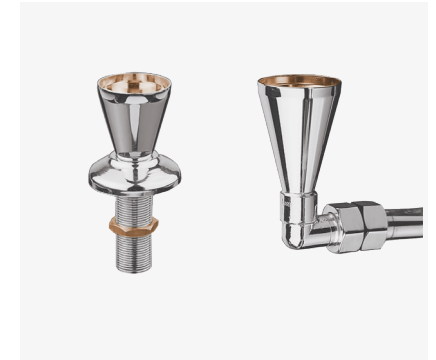
Tundish ZD100 Wall mounted, chromed. ZD101 Sink mounted, chromed.

10" filter for taste and odour removal with limescale reduction. For use with HydroBoil 10 litre models and above.