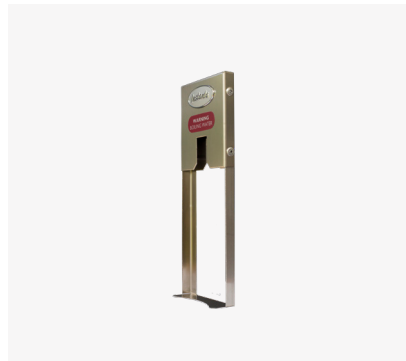
Touch free adaptor XTPA/1

For EconoBoil and HydroBoil. A heat cover for exposed tap outlets preventing the user from any accidental burns.