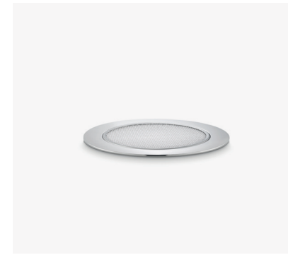
Standalone font 93441UK

Allowing the contactless delivery of boiling water for the EconoBoil and HydroBoil.