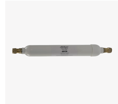
Inline filter FL104

6" filter for taste and odour removal with limescale reduction. For use with HydroBoil up to 7.5 litre models.