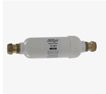
Inline filter FL064

Prevents boiling water being dispensed accidentally. To dispense, a lever on the back of the handle needs to be released.