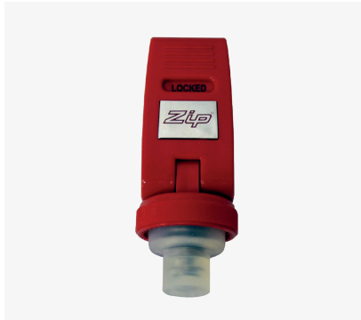
Safety tap top assembly 93734

Prevents boiling water being dispensed accidentally. To dispense, a lever on the back of the handle needs to be released.